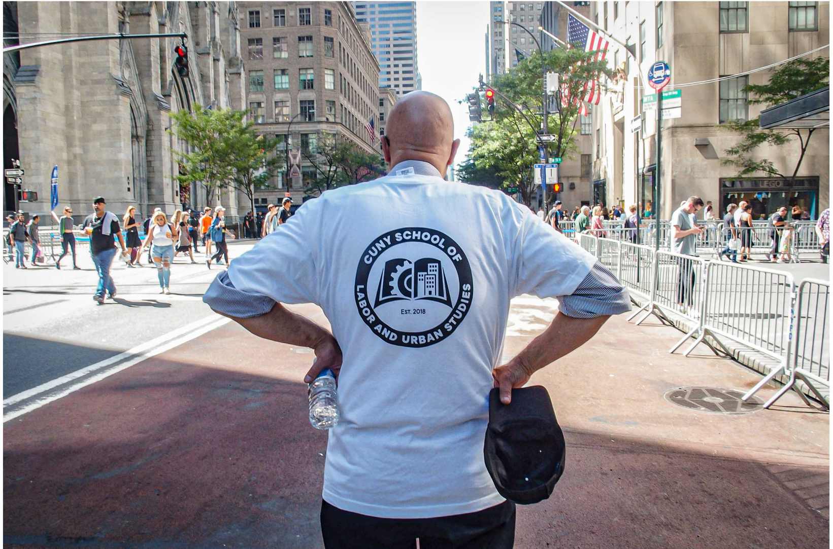
New York City got together to celebrate anew after two years off due to COVID the 2022 NYC Labor Day Parade. Coined as Worker Leading Worker Rising. Together with the workers and different unions of New York City and the surrounding boroughs, NY Governor KATHY HOCHUL, Mayor ERIC ADAMS and Senator CHUCK SCHUMER marched down 5th Avenue to show their support. Other prominent NYC figures also showed their support such as Cardinal Archbishop, TIMOTHY DOLAN. September 10, 2022.