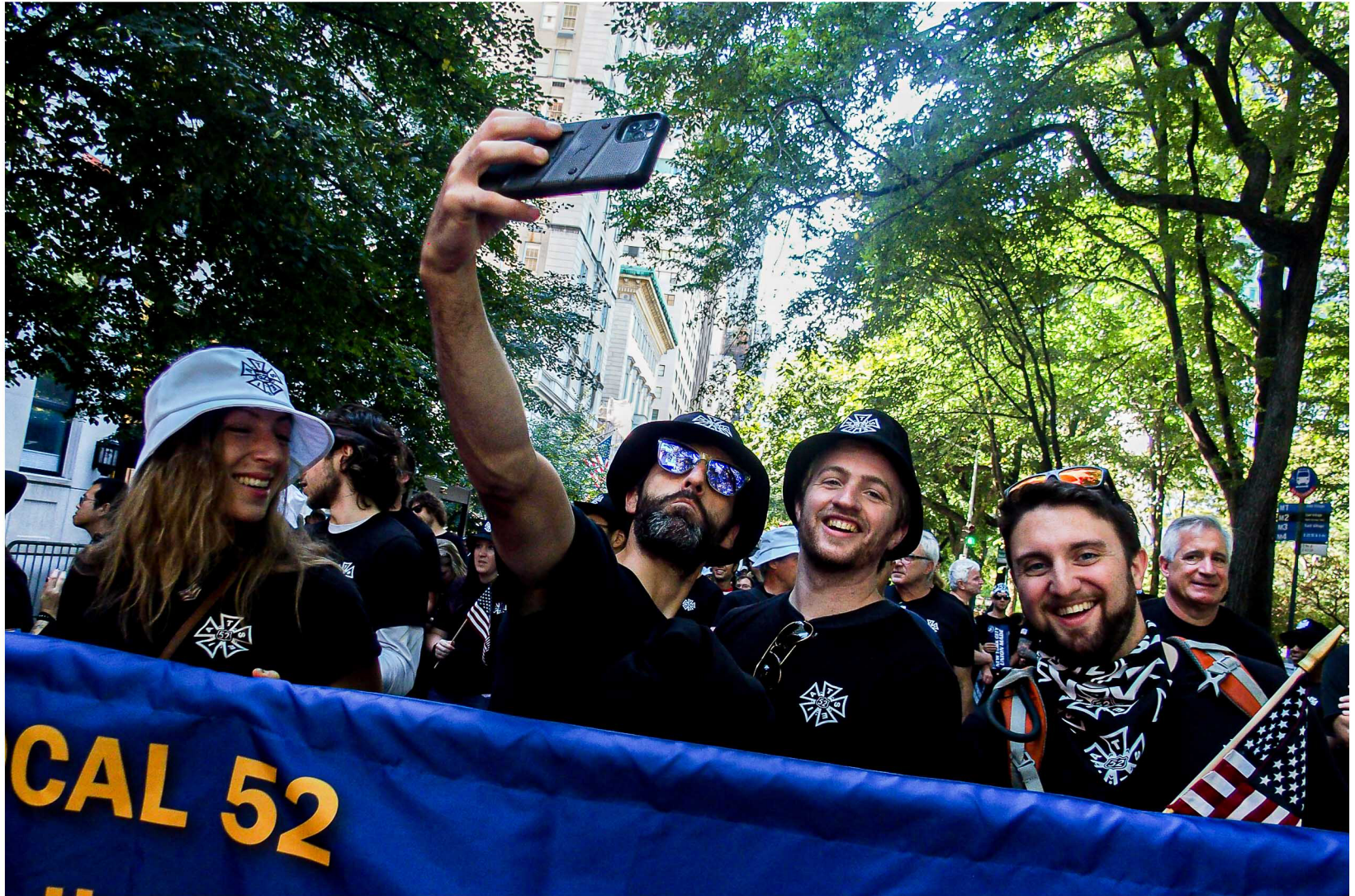
New York City got together to celebrate anew after two years off due to COVID the 2022 NYC Labor Day Parade. Coined as Worker Leading Worker Rising. Together with the workers and different unions of New York City and the surrounding boroughs, NY Governor KATHY HOCHUL, Mayor ERIC ADAMS and Senator CHUCK SCHUMER marched down 5th Avenue to show their support. Other prominent NYC figures also showed their support such as Cardinal Archbishop, TIMOTHY DOLAN. September 10, 2022.