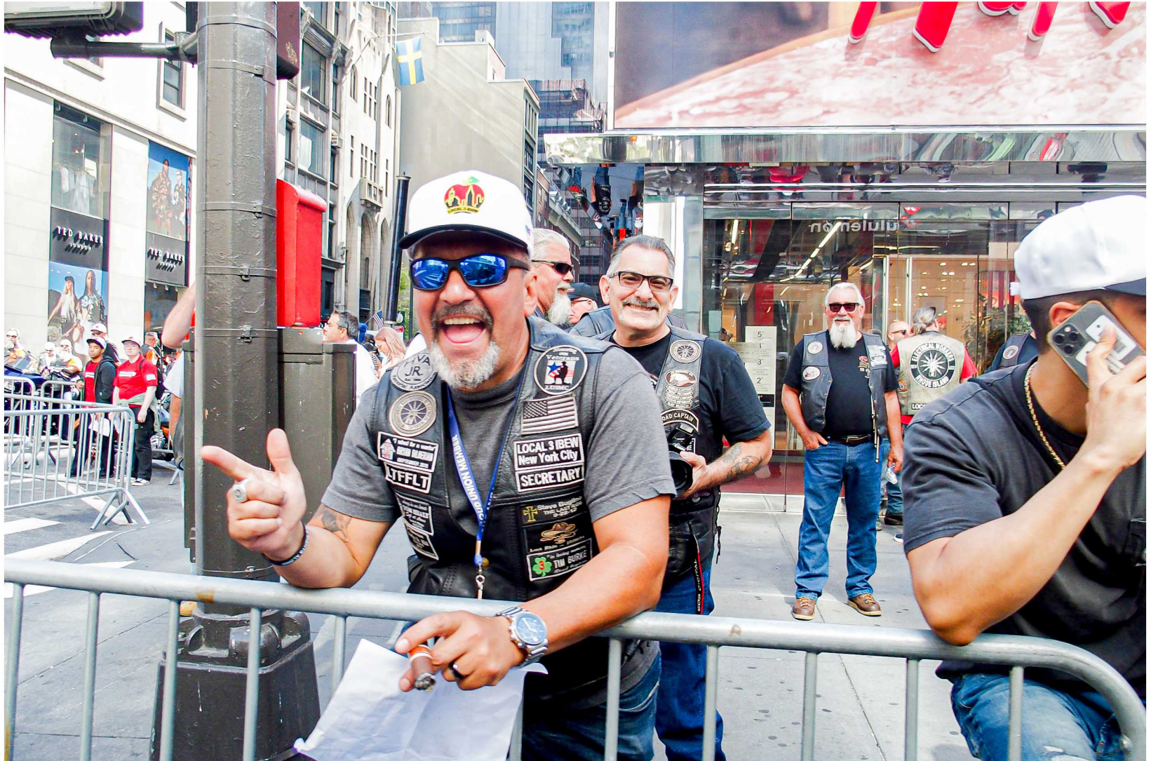
New York City got together to celebrate anew after two years off due to COVID the 2022 NYC Labor Day Parade. Coined as Worker Leading Worker Rising. Together with the workers and different unions of New York City and the surrounding boroughs, NY Governor KATHY HOCHUL, Mayor ERIC ADAMS and Senator CHUCK SCHUMER marched down 5th Avenue to show their support. Other prominent NYC figures also showed their support such as Cardinal Archbishop, TIMOTHY DOLAN. September 10, 2022.