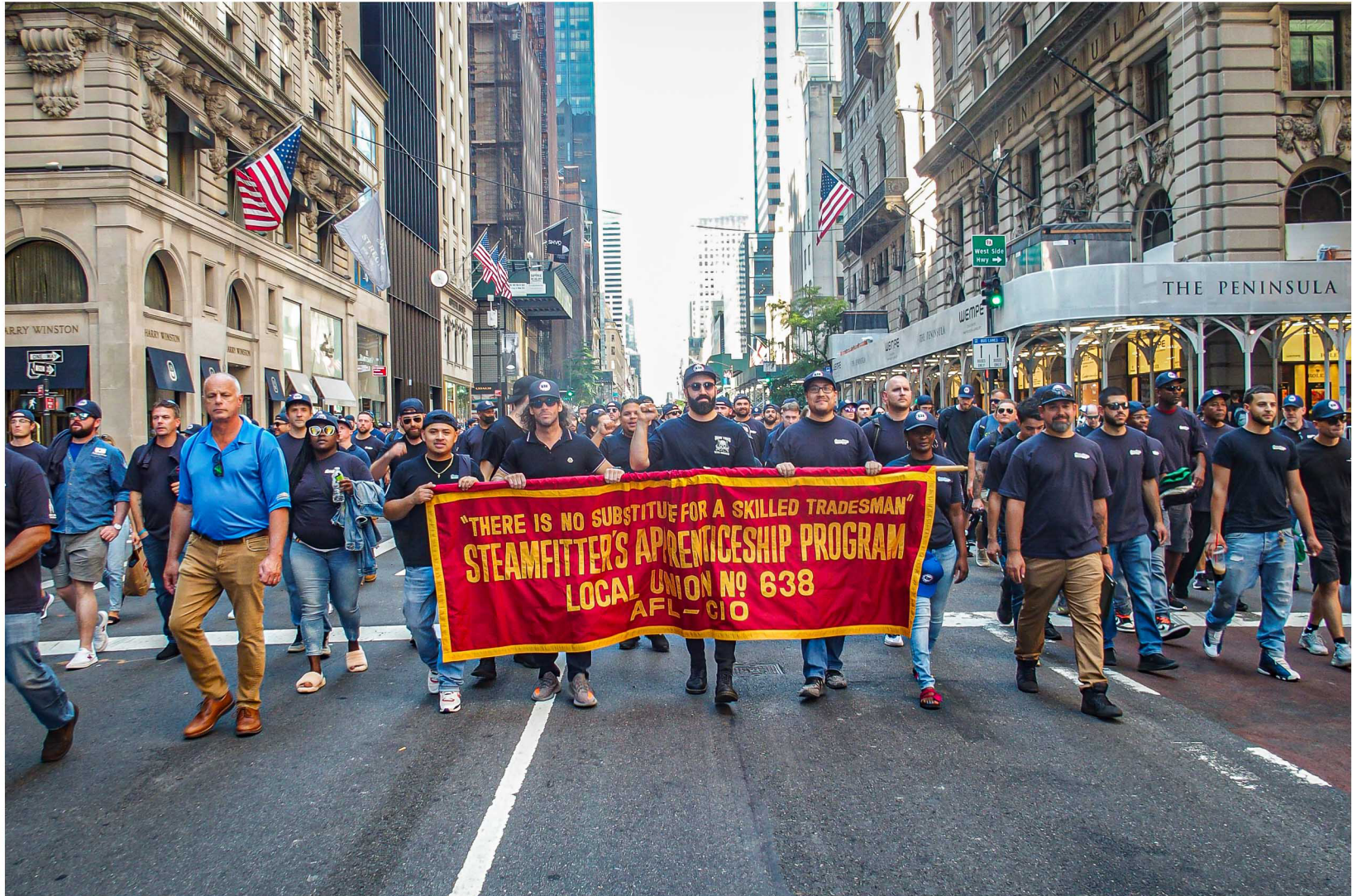
New York City got together to celebrate anew after two years off due to COVID the 2022 NYC Labor Day Parade. Coined as Worker Leading Worker Rising. Together with the workers and different unions of New York City and the surrounding boroughs, NY Governor KATHY HOCHUL, Mayor ERIC ADAMS and Senator CHUCK SCHUMER marched down 5th Avenue to show their support. Other prominent NYC figures also showed their support such as Cardinal Archbishop, TIMOTHY DOLAN. September 10, 2022.