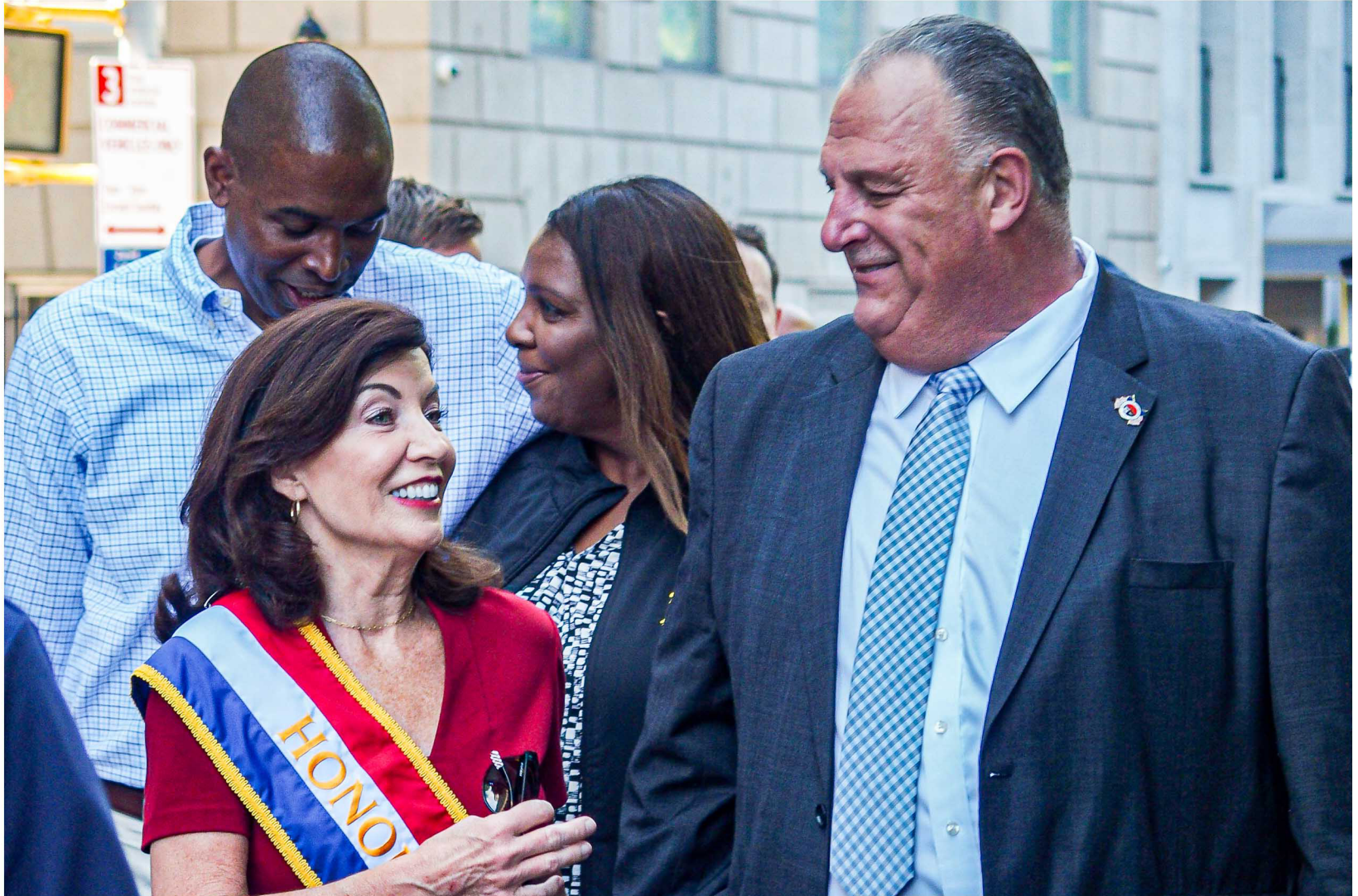
New York City got together to celebrate anew after two years off due to COVID the 2022 NYC Labor Day Parade. Coined as Worker Leading Worker Rising. Together with the workers and different unions of New York City and the surrounding boroughs, NY Governor KATHY HOCHUL, Mayor ERIC ADAMS and Senator CHUCK SCHUMER marched down 5th Avenue to show their support. Other prominent NYC figures also showed their support such as Cardinal Archbishop, TIMOTHY DOLAN. September 10, 2022.