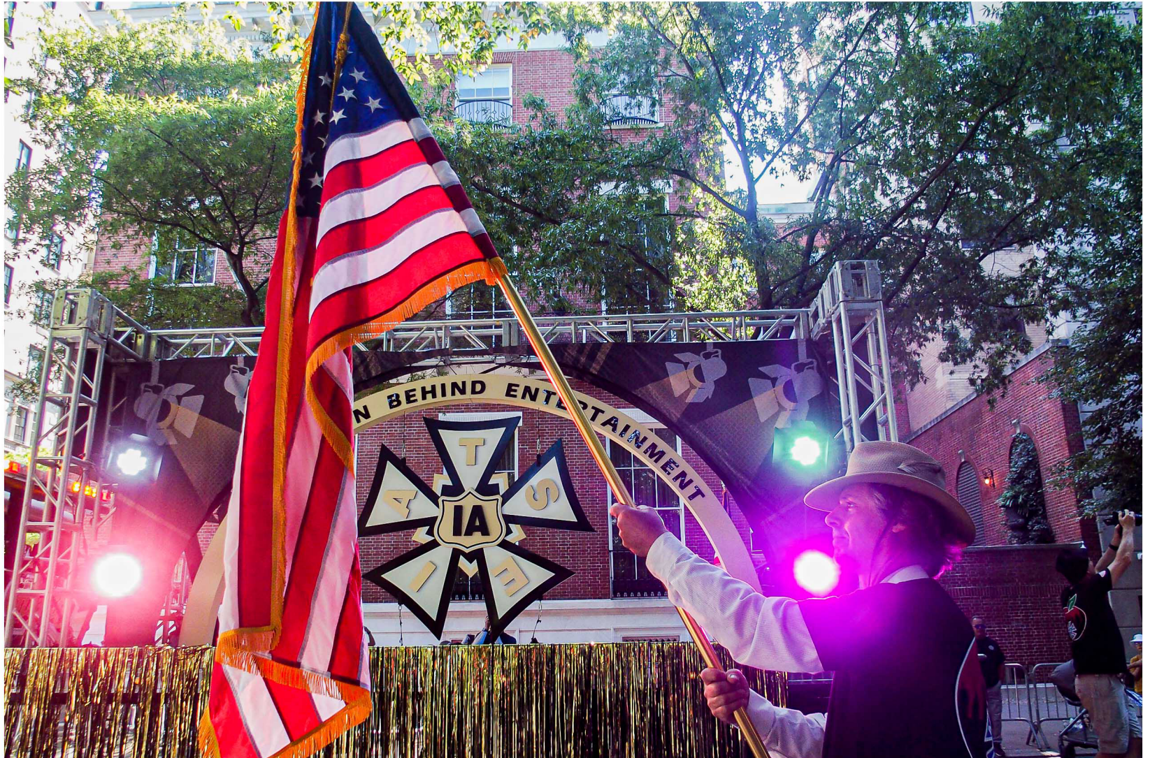
New York City got together to celebrate anew after two years off due to COVID the 2022 NYC Labor Day Parade. Coined as Worker Leading Worker Rising. Together with the workers and different unions of New York City and the surrounding boroughs, NY Governor KATHY HOCHUL, Mayor ERIC ADAMS and Senator CHUCK SCHUMER marched down 5th Avenue to show their support. Other prominent NYC figures also showed their support such as Cardinal Archbishop, TIMOTHY DOLAN. September 10, 2022.