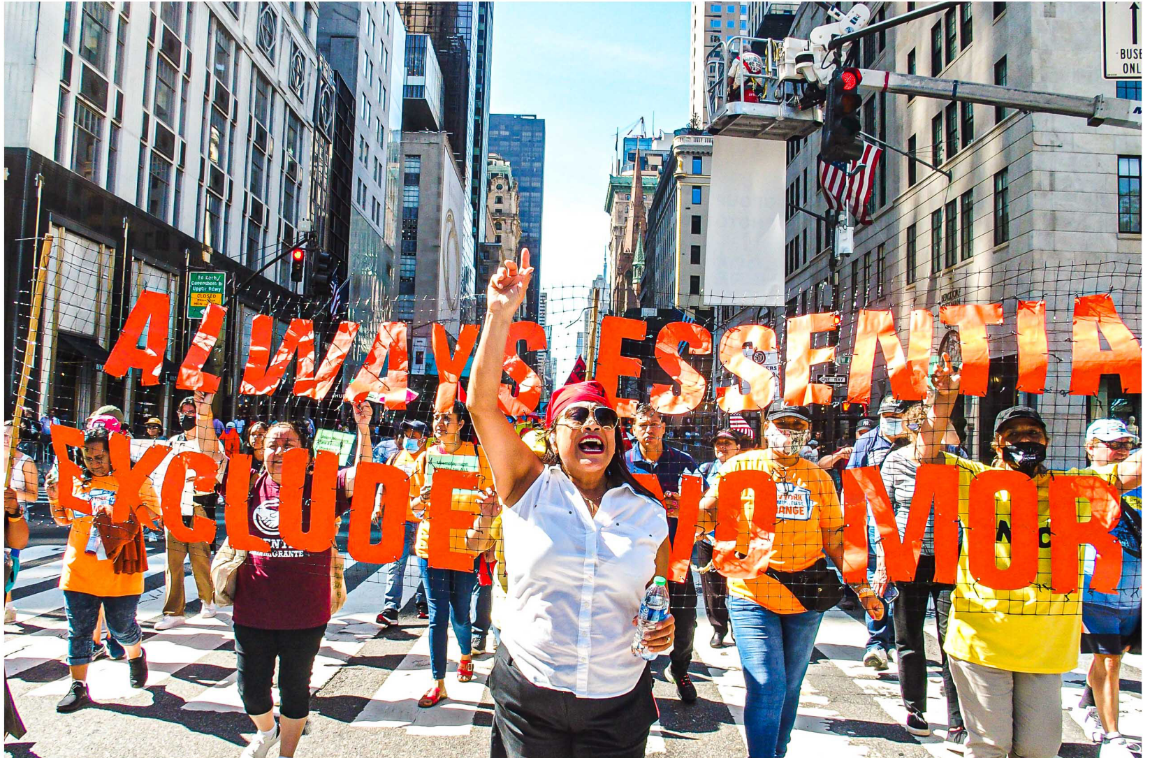
New York City got together to celebrate anew after two years off due to COVID the 2022 NYC Labor Day Parade. Coined as Worker Leading Worker Rising. Together with the workers and different unions of New York City and the surrounding boroughs, NY Governor KATHY HOCHUL, Mayor ERIC ADAMS and Senator CHUCK SCHUMER marched down 5th Avenue to show their support. Other prominent NYC figures also showed their support such as Cardinal Archbishop, TIMOTHY DOLAN. September 10, 2022.