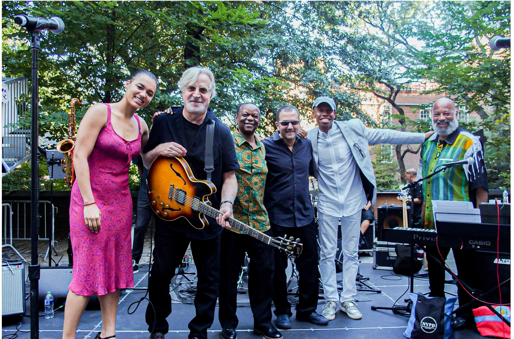
New York City got together to celebrate anew after two years off due to COVID the 2022 NYC Labor Day Parade. Coined as Worker Leading Worker Rising. Together with the workers and different unions of New York City and the surrounding boroughs, NY Governor KATHY HOCHUL, Mayor ERIC ADAMS and Senator CHUCK SCHUMER marched down 5th Avenue to show their support. Other prominent NYC figures also showed their support such as Cardinal Archbishop, TIMOTHY DOLAN. September 10, 2022.