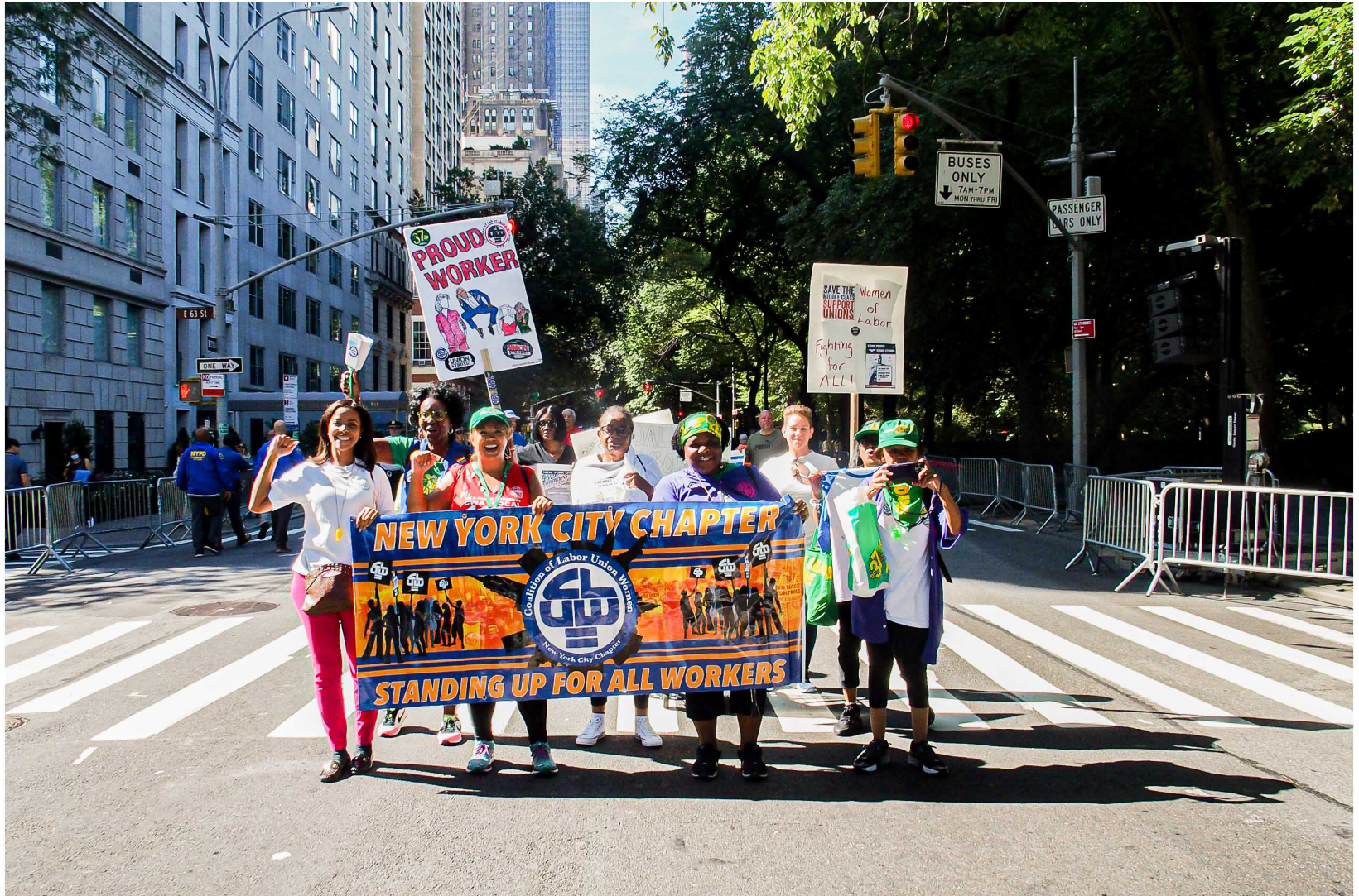
New York City got together to celebrate anew after two years off due to COVID the 2022 NYC Labor Day Parade. Coined as Worker Leading Worker Rising. Together with the workers and different unions of New York City and the surrounding boroughs, NY Governor KATHY HOCHUL, Mayor ERIC ADAMS and Senator CHUCK SCHUMER marched down 5th Avenue to show their support. Other prominent NYC figures also showed their support such as Cardinal Archbishop, TIMOTHY DOLAN. September 10, 2022.