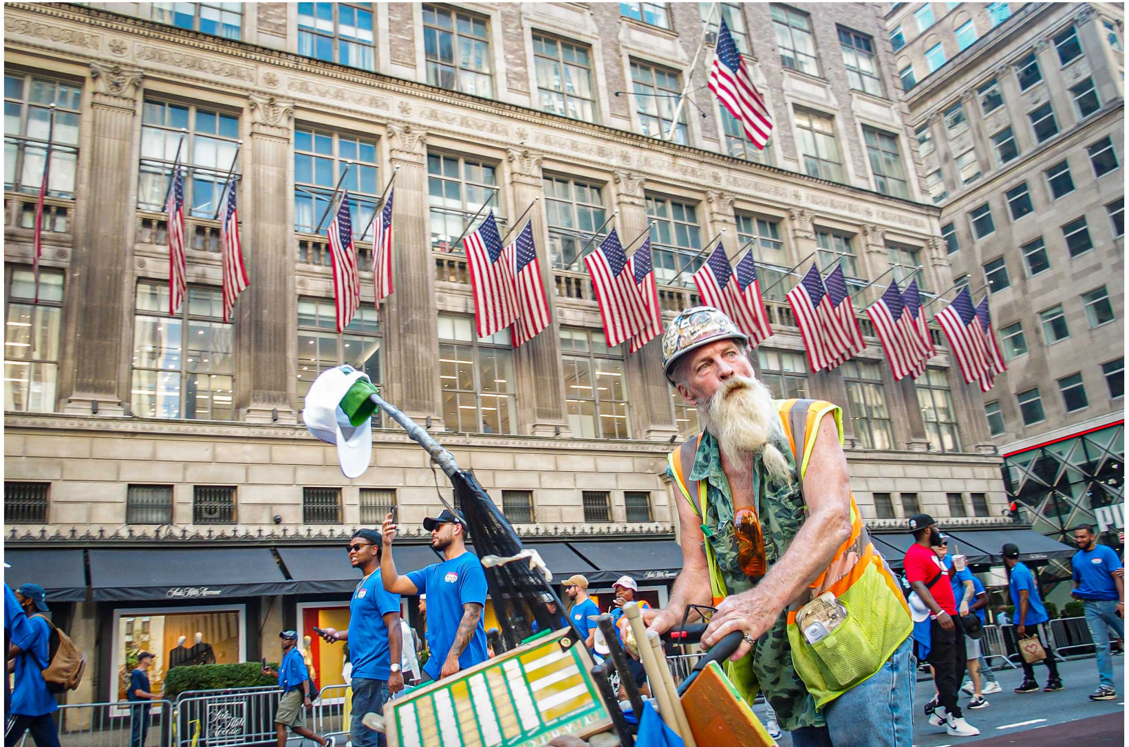
New York City got together to celebrate anew after two years off due to COVID the 2022 NYC Labor Day Parade. Coined as Worker Leading Worker Rising. Together with the workers and different unions of New York City and the surrounding boroughs, NY Governor KATHY HOCHUL, Mayor ERIC ADAMS and Senator CHUCK SCHUMER marched down 5th Avenue to show their support. Other prominent NYC figures also showed their support such as Cardinal Archbishop, TIMOTHY DOLAN. September 10, 2022.