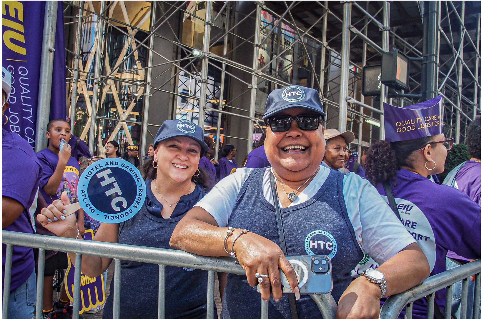
New York City got together to celebrate anew after two years off due to COVID the 2022 NYC Labor Day Parade. Coined as Worker Leading Worker Rising. Together with the workers and different unions of New York City and the surrounding boroughs, NY Governor KATHY HOCHUL, Mayor ERIC ADAMS and Senator CHUCK SCHUMER marched down 5th Avenue to show their support. Other prominent NYC figures also showed their support such as Cardinal Archbishop, TIMOTHY DOLAN. September 10, 2022.