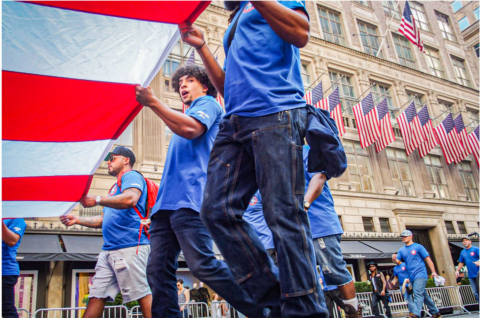
New York City got together to celebrate anew after two years off due to COVID the 2022 NYC Labor Day Parade. Coined as Worker Leading Worker Rising. Together with the workers and different unions of New York City and the surrounding boroughs, NY Governor KATHY HOCHUL, Mayor ERIC ADAMS and Senator CHUCK SCHUMER marched down 5th Avenue to show their support. Other prominent NYC figures also showed their support such as Cardinal Archbishop, TIMOTHY DOLAN. September 10, 2022.