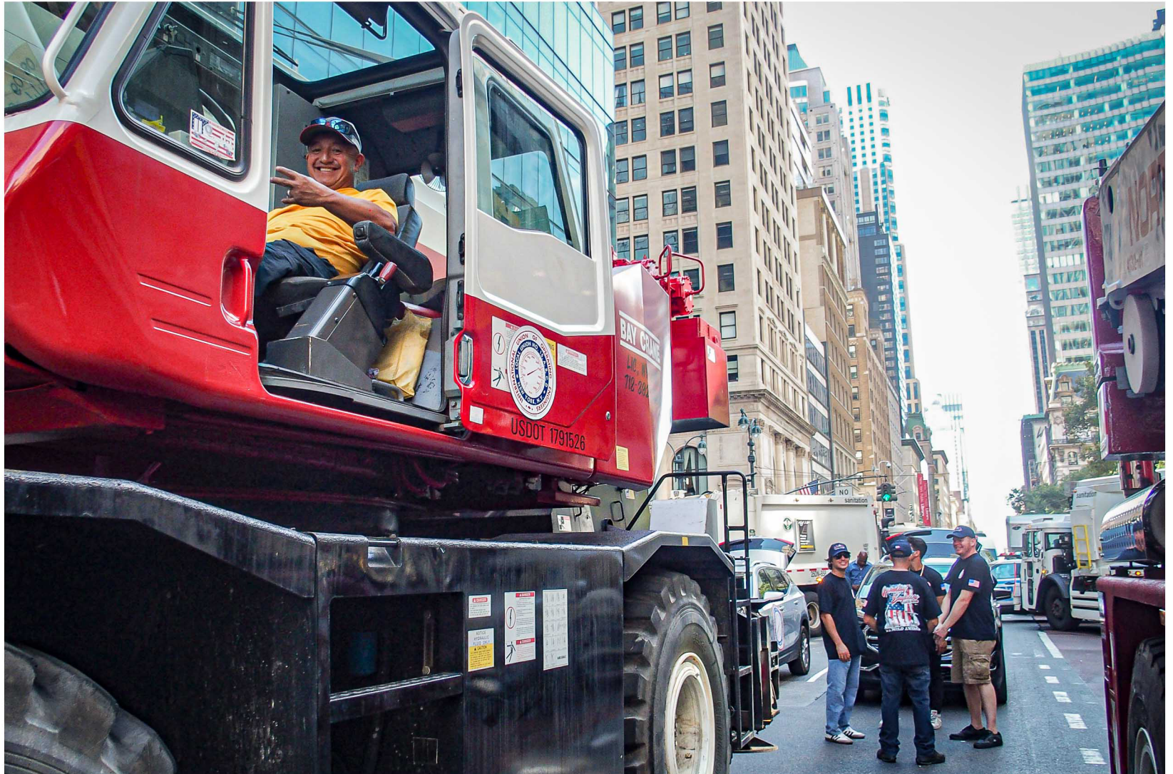
New York City got together to celebrate anew after two years off due to COVID the 2022 NYC Labor Day Parade. Coined as Worker Leading Worker Rising. Together with the workers and different unions of New York City and the surrounding boroughs, NY Governor KATHY HOCHUL, Mayor ERIC ADAMS and Senator CHUCK SCHUMER marched down 5th Avenue to show their support. Other prominent NYC figures also showed their support such as Cardinal Archbishop, TIMOTHY DOLAN. September 10, 2022.