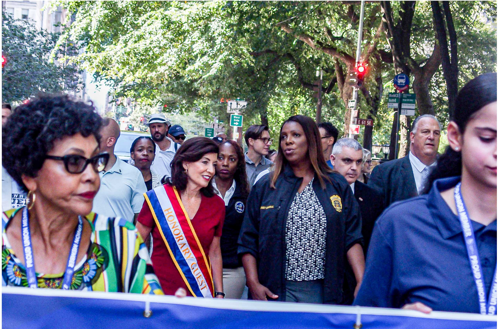
New York City got together to celebrate anew after two years off due to COVID the 2022 NYC Labor Day Parade. Coined as Worker Leading Worker Rising. Together with the workers and different unions of New York City and the surrounding boroughs, NY Governor KATHY HOCHUL, Mayor ERIC ADAMS and Senator CHUCK SCHUMER marched down 5th Avenue to show their support. Other prominent NYC figures also showed their support such as Cardinal Archbishop, TIMOTHY DOLAN. September 10, 2022.