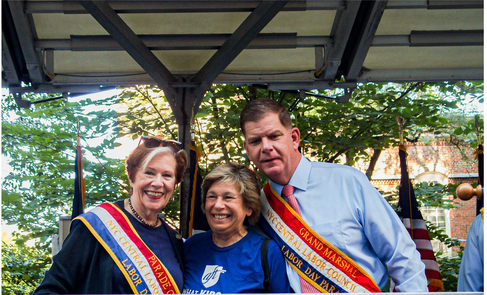
New York City got together to celebrate anew after two years off due to COVID the 2022 NYC Labor Day Parade. Coined as Worker Leading Worker Rising. Together with the workers and different unions of New York City and the surrounding boroughs, NY Governor KATHY HOCHUL, Mayor ERIC ADAMS and Senator CHUCK SCHUMER marched down 5th Avenue to show their support. Other prominent NYC figures also showed their support such as Cardinal Archbishop, TIMOTHY DOLAN. September 10, 2022.