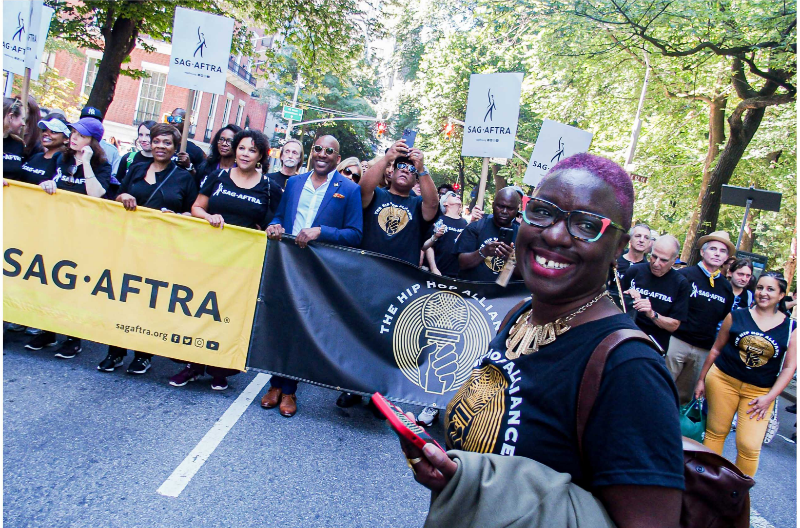
New York City got together to celebrate anew after two years off due to COVID the 2022 NYC Labor Day Parade. Coined as Worker Leading Worker Rising. Together with the workers and different unions of New York City and the surrounding boroughs, NY Governor KATHY HOCHUL, Mayor ERIC ADAMS and Senator CHUCK SCHUMER marched down 5th Avenue to show their support. Other prominent NYC figures also showed their support such as Cardinal Archbishop, TIMOTHY DOLAN. September 10, 2022.