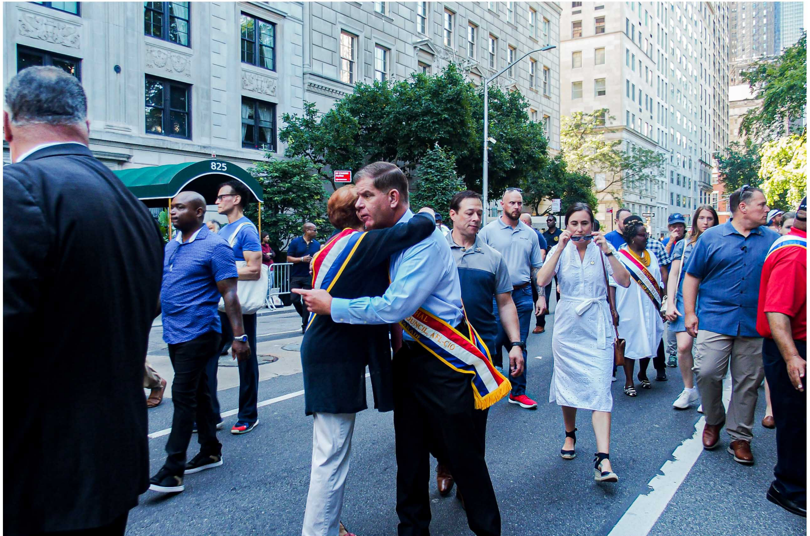
New York City got together to celebrate anew after two years off due to COVID the 2022 NYC Labor Day Parade. Coined as Worker Leading Worker Rising. Together with the workers and different unions of New York City and the surrounding boroughs, NY Governor KATHY HOCHUL, Mayor ERIC ADAMS and Senator CHUCK SCHUMER marched down 5th Avenue to show their support. Other prominent NYC figures also showed their support such as Cardinal Archbishop, TIMOTHY DOLAN. September 10, 2022.